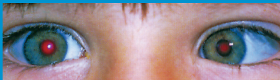
2. A squint, where one eye looks in or out