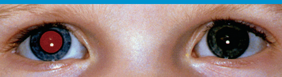
5. An absence of red eye in one pupil