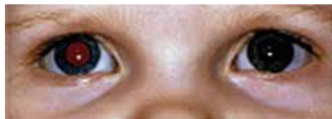
Figure 3. Red reflex absent in left eye

When specialist consultants in retinoblastoma diagnose children, they take a photo of the retina on a RetCam. Figure 6 shows a healthy retina and Figure 7 shows a retinoblastoma tumour. Tumours will differ in each individual child. They may be different in size, shape, position and quantity.