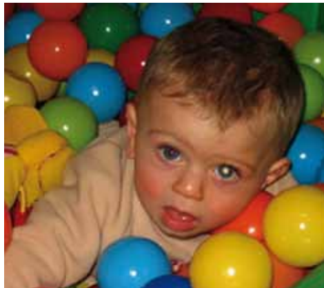
Figure 1. Boy with white reflex in his eye

Children present to general practice with suspected retinoblastoma at different ages depending on the form the child may have. A child with the heritable form is usually diagnosed within the first year of life, with the average age at diagnosis being 9 months. Cases of sporadic retinoblastoma usually present much later and the average age at diagnosis is 24 months (Wallach et al, 2006).