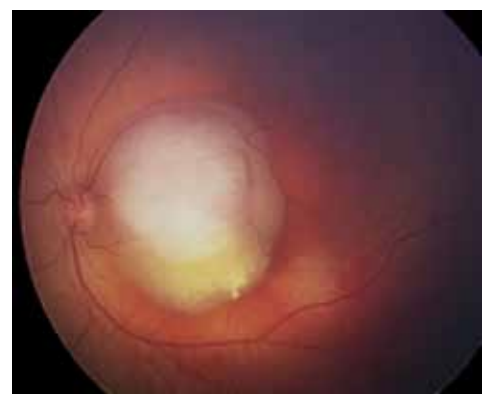
Figure 7. Retinoblastoma tumour

If a patient is referred to an ophthalmologist, it is appropriate to inform the patient about the concerns and suspicions. This can be done by telling a child and his/her parents that a specialist eye examination is taken for many reasons and that it is important to rule out anything serious. Other conditions which may present with leukocoria are cataract, Coats' disease, toxoplasmosis and persistent hyperplastic primary vitreous. It is not necessary to tell the families of all patients that eye cancer is suspected, but some families will