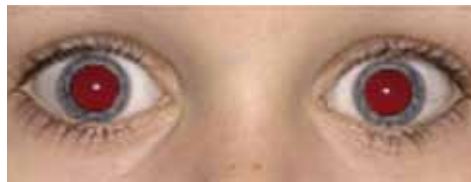
Figure 2. Eyes with normal red reflex